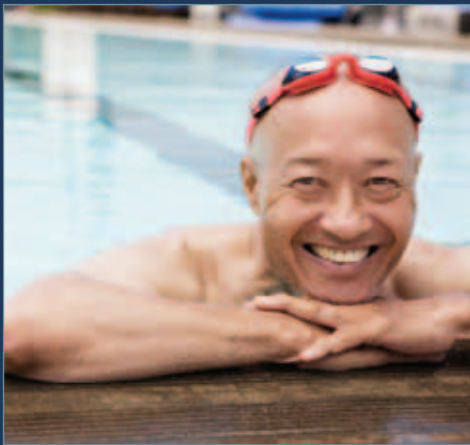
Fitness is a daily priority for many of our residents.

JOIN OUR PRIORITY PROGRAM LIST TODAY BY CALLING 800-451-5121