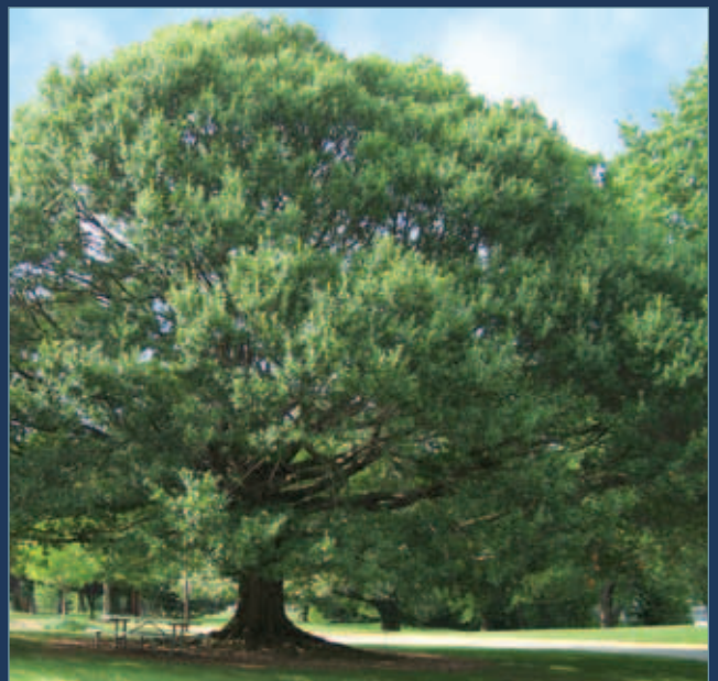
Vinson Hall received the 2010 Friends of Trees Award from the Fairfax County Tree Commission for the efforts put forth in the expansion plans to preserve the signature willow oak, which is more than 100 years old, and other significant trees throughout the community.