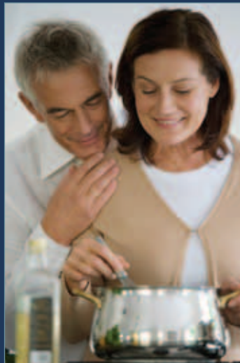
Lifelong cooks coming to live at Vinson Hall will love the contemporary kitchens!