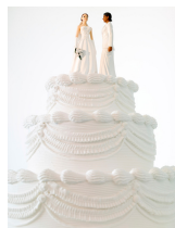
June brings memories of weddings.....

“Living with someone you love is delightful and a wonderful way to live”