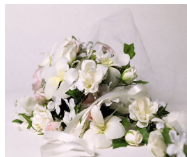
Lovely wedding floral bouquets are a sensorial pleasure, full of fragrant memories

“In fact summer, and June in particular, was once the most popular wedding month for brides”