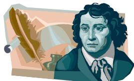
Poetry in motion— Our residents are very creative!

April Showers Prom- ised us May flowers;